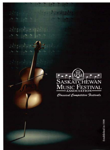
SMFA Blank Cards 5 1/2" X 4" Price: $1.00 each