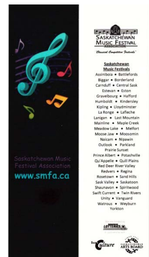
Book marks – 5 1/2" X 1 1/2" (both sides are shown) FREE