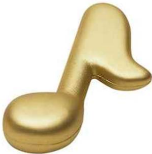
Musical Note Stress Balls with SMFA logo Price: $2.00 each

The Provincial Office has a number of Promotional Items – great for providing visibility of music festivals in your community and as prizes or gifts for festival participants! In addition to Certificates of Participation and Appreciation, SMFA Music Cases, and lanyards we have a few new items. Take a look!