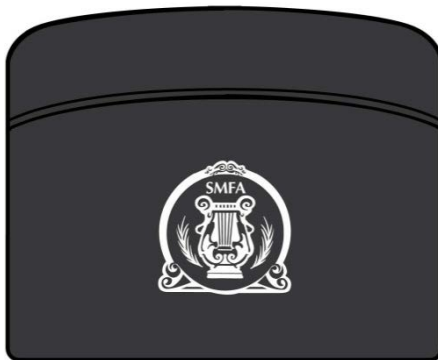
SMFA Padfolio 11" X 13" Price: $20.00 each