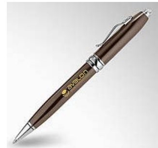
SMFA Pen with LED flashlight beam at the top. Price: $5.00 each