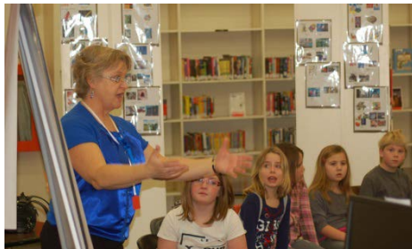
Heather talks about communication from brain to brain

Each school was presented with a copy of the SMFA Syllabus, as well as multiple copies of the speech arts manual. Students were given handouts at the end of the presentation, which included information on how to enter their local music festival.