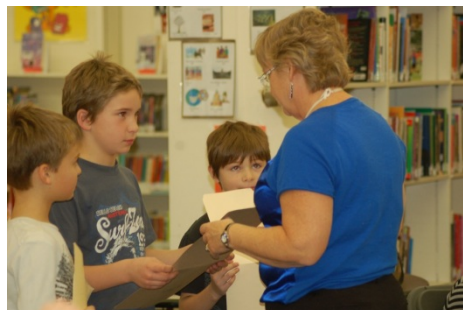
Students are given a sentence to read, with instructions to place different emphasis on specific words, to show how a sentence can have a different meaning.

SMFA Speech Arts Workshops are supported by the Program Enhancement Fund. Contact the provincial office if your festival is interested in hosting a workshop in the future.