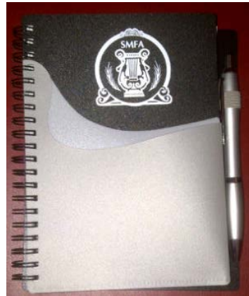
SMFA Notebook with matching pen 7" X 6" Price: $10.00 each