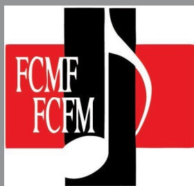
FEDERATION OF CANADIAN MUSIC FESTIVALS La Fédération canadienne des festivals de musique

The Federation of Canadian Music Festivals wishes you a successful 2016 festival season and extends our gratitude to the many volunteers who make this possible each year!