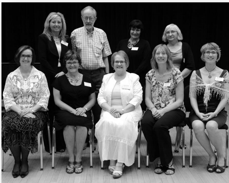
SMFA Provincial Board of Directors:

Music really is for all, whether we learn it or ably support those who do, whether we live it or actively participate in it, and whether we love it or appreciate it in its many forms.