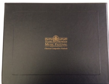
Certificate Holder Price: $10 each