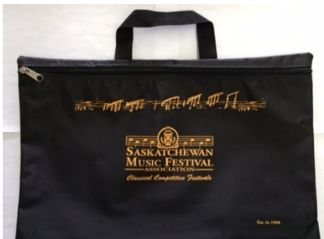
Music Case Price: $10 each