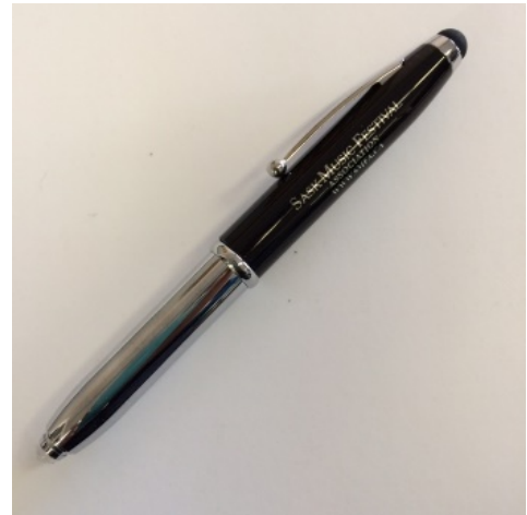
SMFA Pen with LED flashlight beam & stylus Price: $5 each