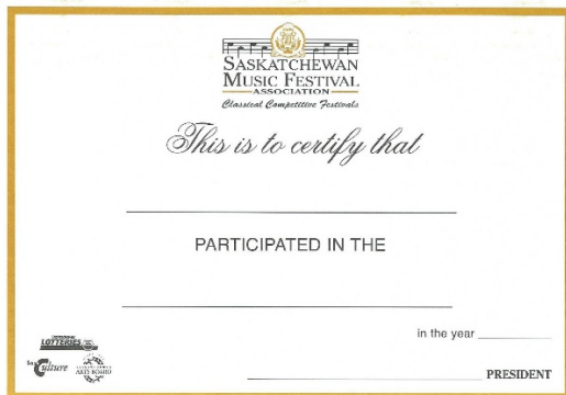
SMFA Participation Certificate Price: 40¢ each

The Provincial Office has a number of Promotional Items – great for providing visibility of music festivals in your community and as prizes or gifts for festival participants, volunteers and adjudicators! In addition to Certificates of Participation and Appreciation, and SMFA Music Cases, we have the following items. Take a look!