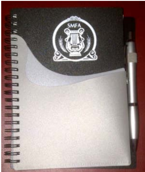
SMFA Notebook & Pen Price: $10 each