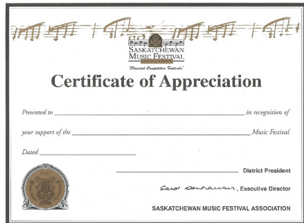
SMFA Certificate of Appreciation Price: 40¢ each