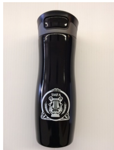
SMFA Mug Price: $25 each