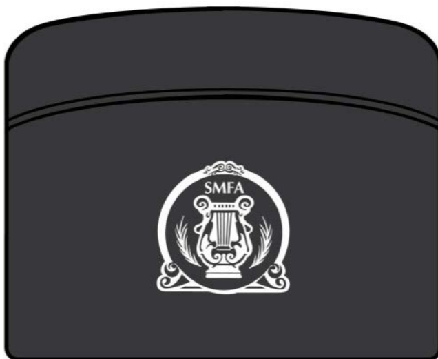
SMFA Padfolio 11" x 13" Price: $25 each